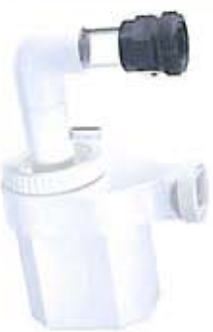
Delttec DCS pump

Delttec Skimmers of the TC and SC series are quiet in operation and due to their efficiency and low energy consumption hardly transfer any heat to the aquarium water.